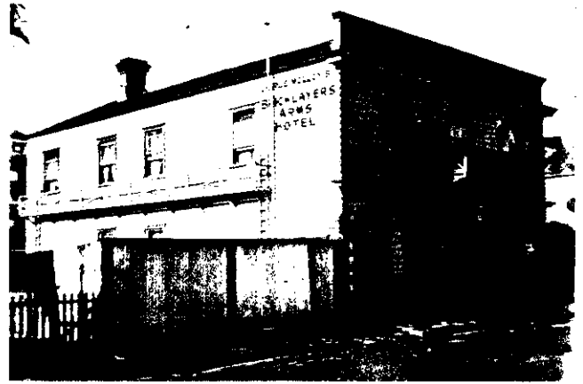
THE BRICKLAYERS' ARMS HOTEL, FEDERAL STREET.