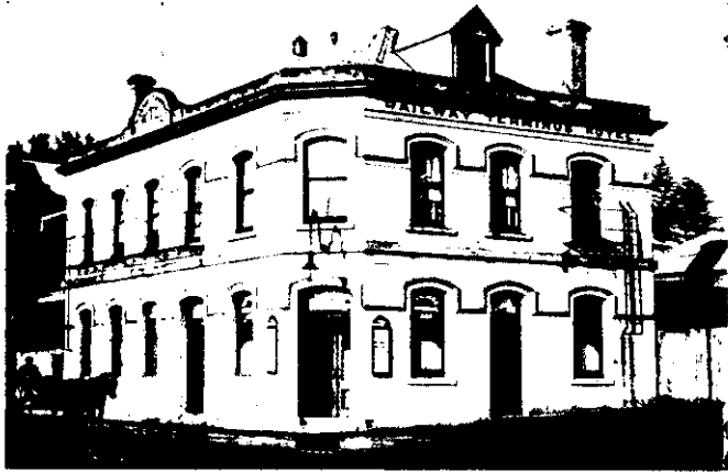
THE RAILWAY TERMINUS, BEACH ROAD.