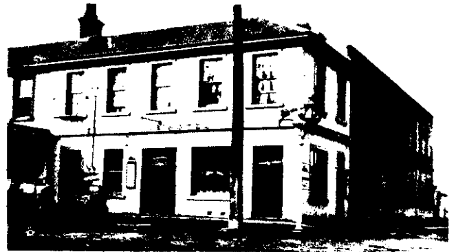
THE NEWTON HOTEL, NEWTON.