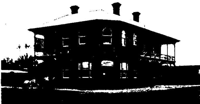
THE ST. HELIER'S BAY HOTEL, ST. HELIER'S BAY