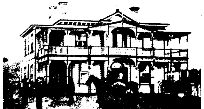
THE STAR AND GARTER, PANMURE.