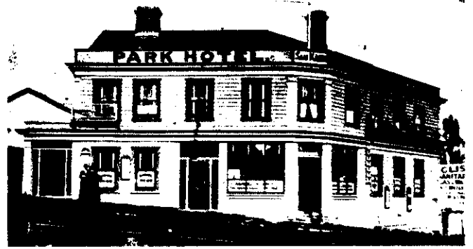
THE PARK HOTEL, WELLESLEY STREET.

Reduction was carried in both Auckland and Parnell licensing districts at the last election. The Auckland Committee last week refused 5 licenses and the Parnell Committee two: the Star and Garter at Panmure, and the St. Helier's Bay Hotel.