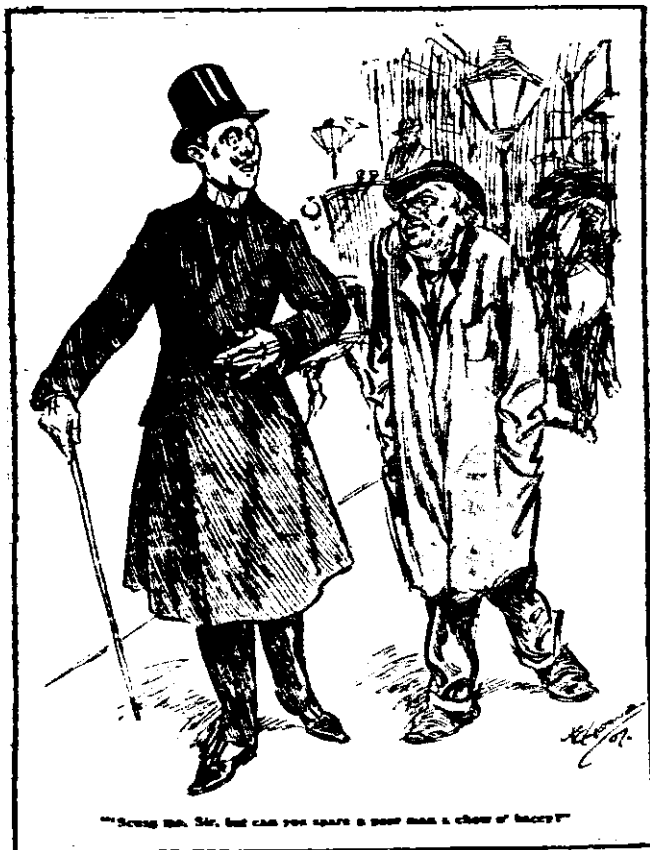
"Bring the, Sir, but can you spare a poor man a cheer of honey?"

Mother-in-law: "Oh, to see Naples and then die!" Son-in-law: "To-morrow we start tra- velling."