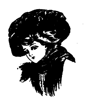
TOQUE OF SMOKE-GREY VELVET. Edged with two mink skins, with heads and talks.

poind of a cluster of sliver resebuds and two sprays of sliver leaves passed round the hair.