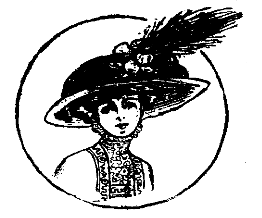
This nat is a wide-brianned hat of biscuit-coloured felt with crown of sable, and a cluster of oranges with brown aigrette.

bunch of oak apples, the whole repro-ducing the warm shadow of sunset and brown now seen in the woods. Very carlous was an ornament made of bands of ermine; it is rarely that fur is seen worn in the bair. In com-pany with the ermine were strips of white net embroidered with pearis; the two crossed in the centre, and were held together by an ermine loop. Above the parts fringes of pearls appeared, and at the back of the mack, underneath the clas-solvally arranged chignon, the pearl and ornaine bands met hearath a second loop of ornize. of ormaine.