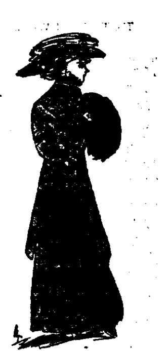
A USEFUL COAT AND SKIRT COSTUBE.

I can generally see something attractive in, or something to be learnt from the wildest ragaries of fashion, but I nust admit that the new toque has earn-ed my undying antipathy. I mean that