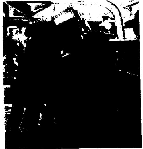
LAUNCH BOILER UNDER REPAIRS.