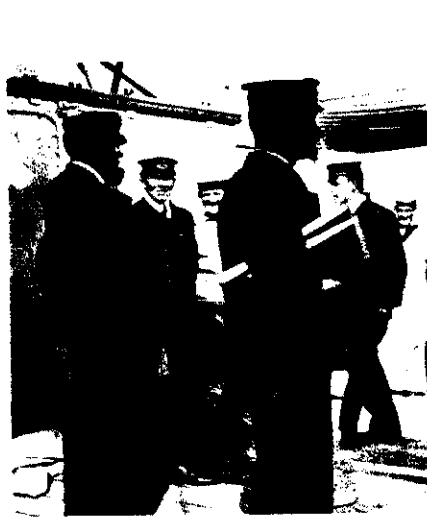
TELLING OFF MEN FOR DUTY.