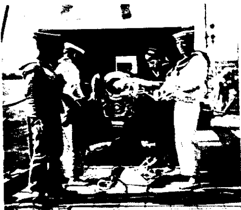
AT THE BIG GUN.