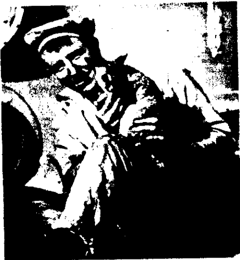
THE SHIP'S PET—AN AUSTRALIAN GISSUMAL.