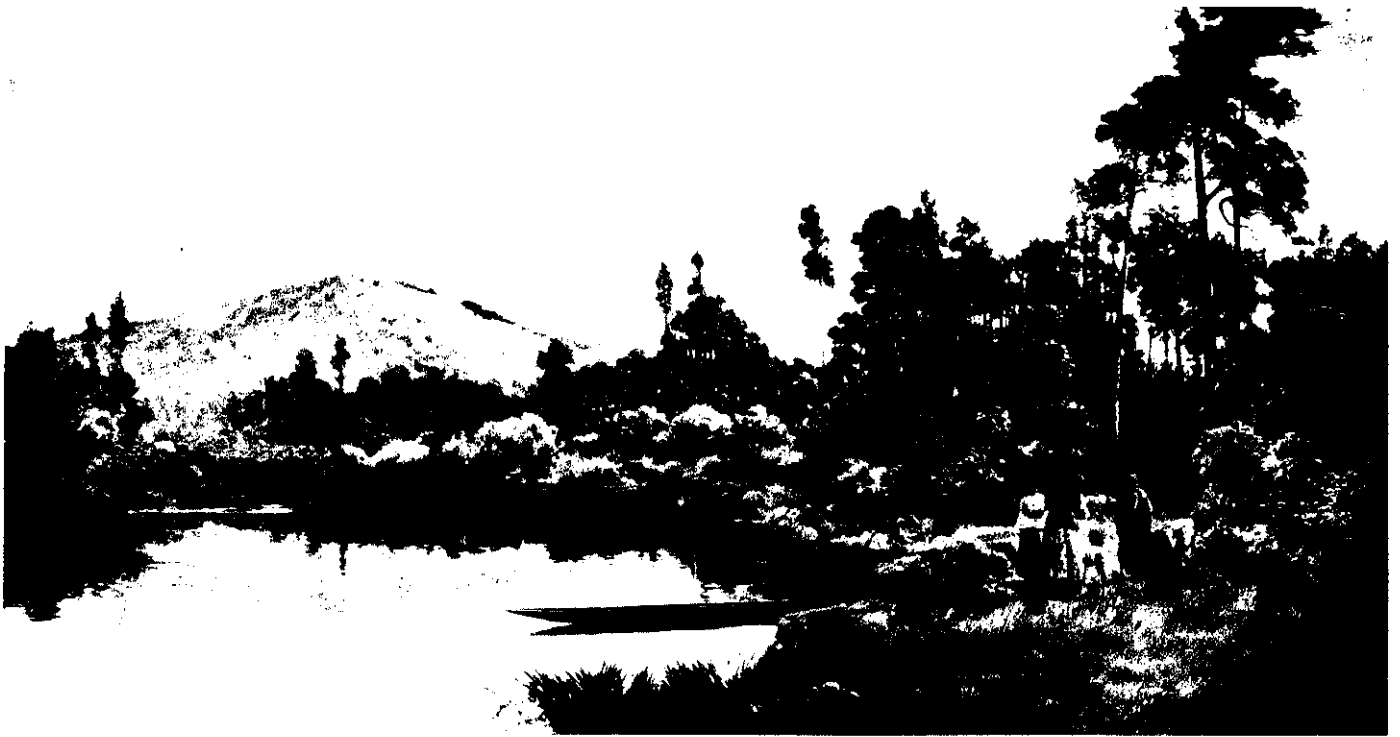
(75 x 43, Oil)