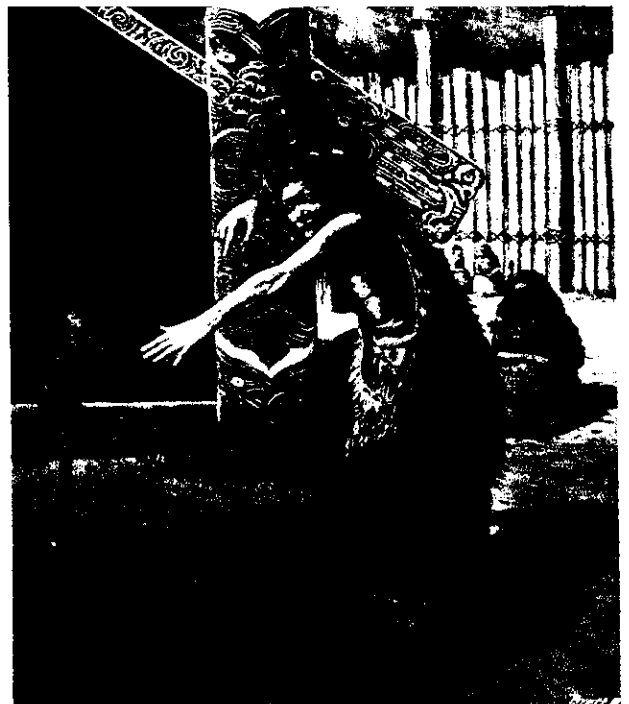
"DEFIANCE" BY L. J. STEELE. (11 X 8. OIL.)

PICTURES FROM THE AUCKLAND SOCIETY OF ARTS' ANNUAL EXHIBITION.