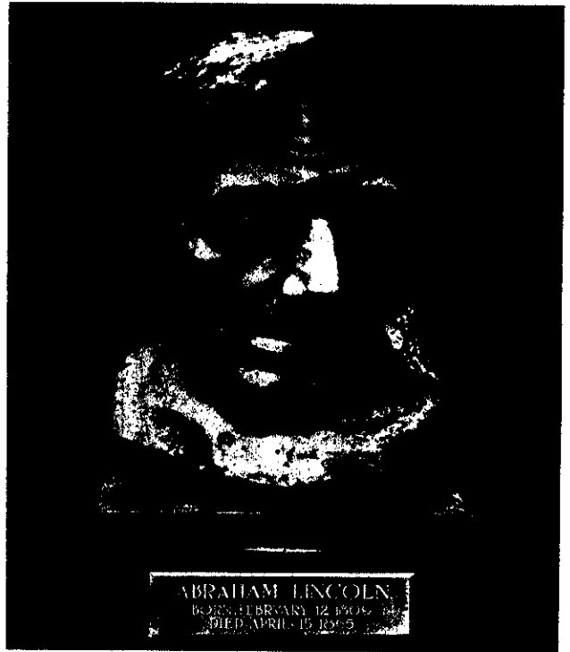
BUST OF ABRAHAM LINCOLN BY GUTZON BORGLUM,

Lincoln's lowly birth, his early struggles in the backwoods, his efforts to educate himself, his keenness to excel in the professional life of his country, his fine record as an upright politician, his honest and lofty administration as President,