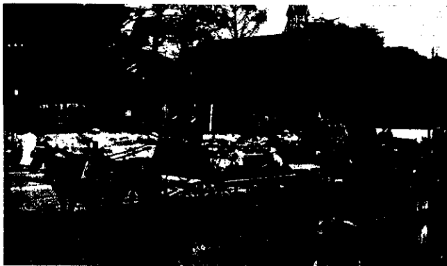
THE LAST PENGUIN VICTIM.

When the White Star liner Corinthia arrived in Wellington on Monday last week, the medical officer found it necessary to quarantine forty-three persons on Somes Island, owing to the presence of scarlet fever and measles among the passengers. The scarlet fever patients were removed to the hospital. Owing to there being sickness on board the usual rush of people aboard which usually occurs on the mooring of a vessel was prevented. The Corinthia brought 500 immigrants to New Zealand.