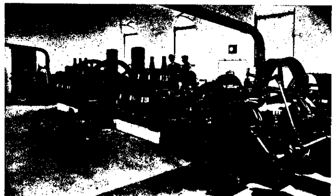
THE NEW PUMPING STATION FOR THE ONEHUNGA WATERWORKS.