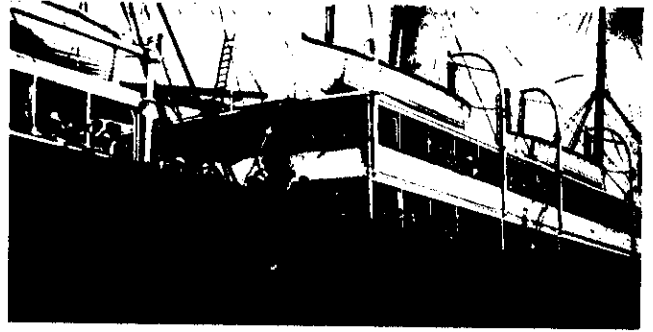
ALONGSIDE THE QUEEN'S WHARF, WELLINGTON. The Corinthia's gangway drawn up and passengers waiting on board.