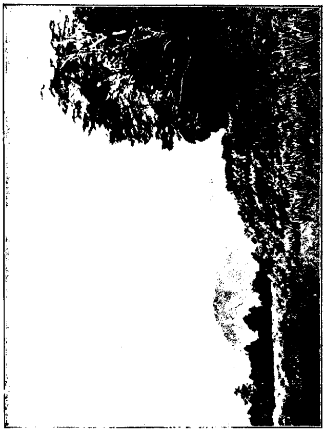
NGAURUHOE FROM NEAR THE WHAKAPAPA STREAM.