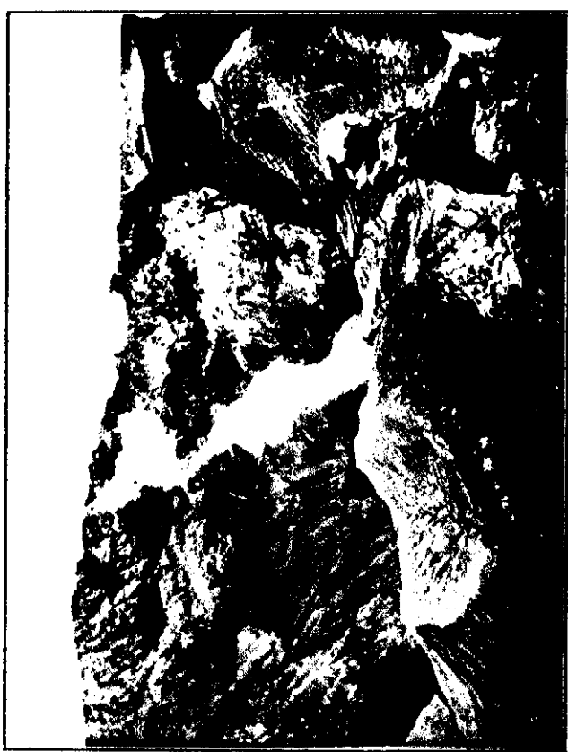
NGAURUHOE'S CRATER BEFORE LAST WEEK'S ERUPTION