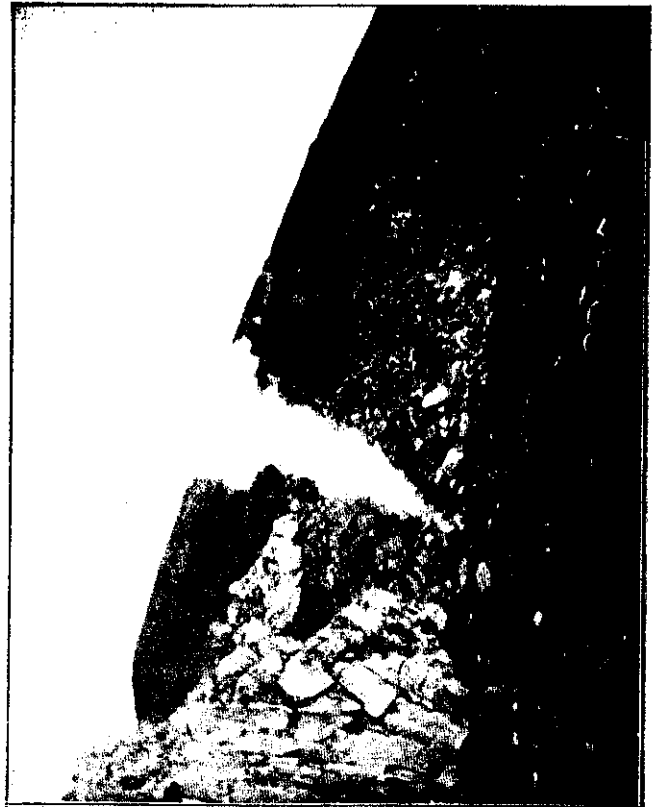
STEAM VENT AT THE SIDE OF THE RED CRATER, TONGARIRO.