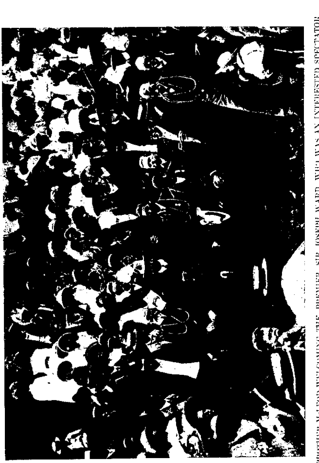
BROTHER MALEOD WELCOMING THE PREMIER, SIR JOSEPH WARD, WHO WAS AN INTERESTED SPECTATOR DURING THE AFFERNOON.