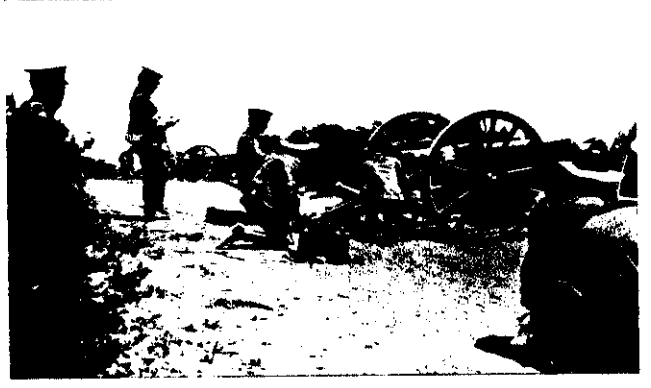
SIGHTING THE GUN.