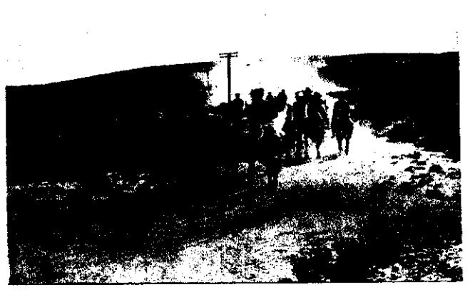
...DRIVEN BY THE ENEMY, AND RETIRING TO A FRESH POSITION.