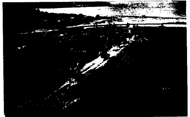
LEAVING BROWN'S BAY FOR THE FIRING LINE.

HEAVY GUN FIRING AND MILITARY MANOEUVRES BY MEMBERS OF THE "A" BATTERY, NEAR BROWN'S BAY, AUCKLAND.