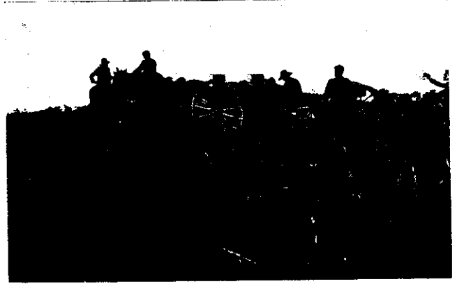
TAKING A GUN INTO ACTION IN ROUGH COUNTRY.