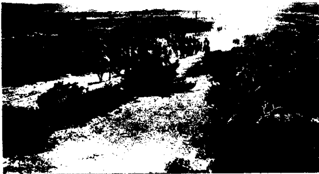
TAKING UP A NEW POSITION.