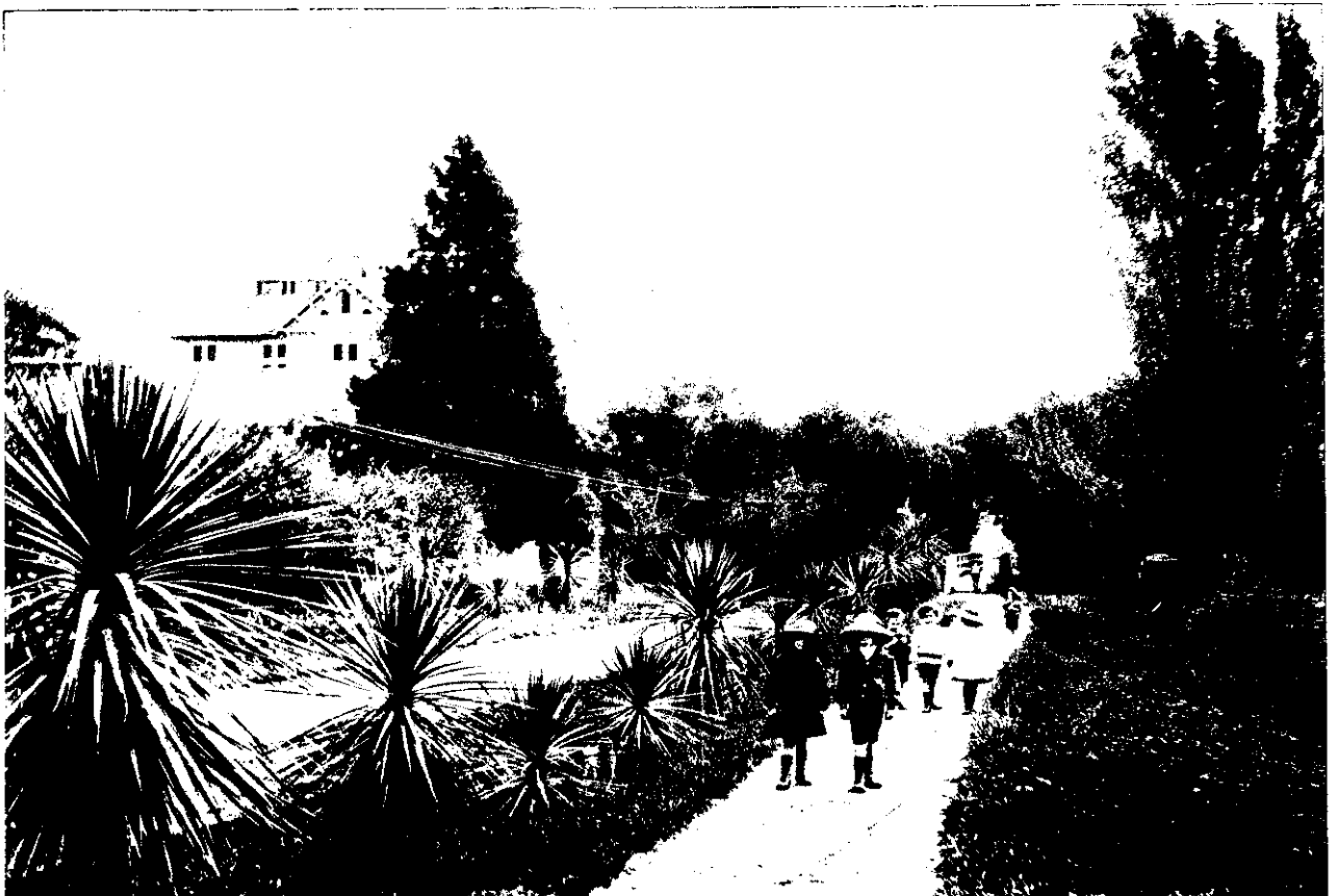
MANUKA-STREET, NELSON, SHOWING THE CONVENT AND SPIRE OF CATHOLIC CHURCH.

NELSON'S ANNIVERSARY: SOME VIEWS OF THIS BEAUTIFUL CITY AND SURROUNDINGS.