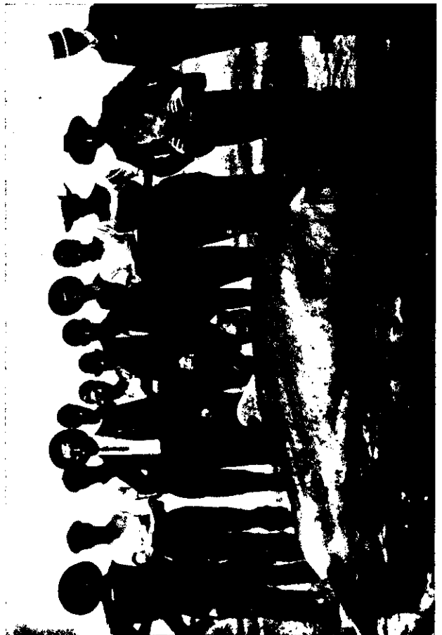
AN UNUSUAL VISITOR TO WANGAITI THE BREAMFISH, CAPTURED IN THE WANGAITI RIVER LAST WEEK.