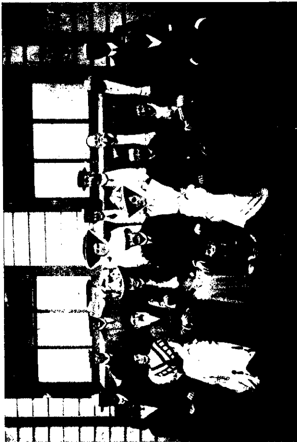
SUR JOSEPH WARD AND PARTY AT THE LAYING OF THE FOUNDATION STONE, NEW POST OFFICE, HASTINGS.