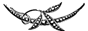
F 593.—16 ct. Gold Pearl Set Half Moon and Spray Brooch in Morocco Case, £5/10/-.