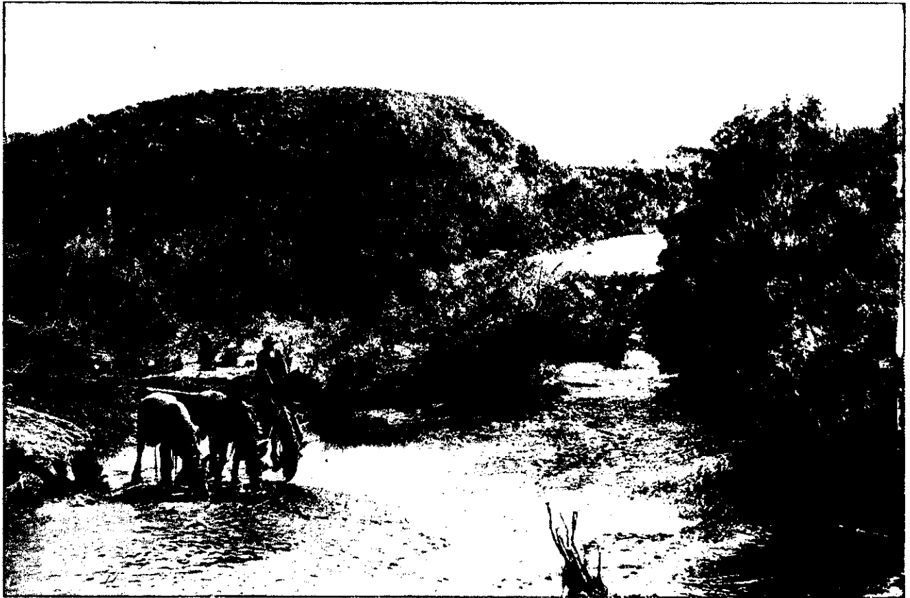
THE FORD: A TYPICAL NEW ZEALAND CREEK SCENE.