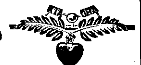
H2011.—9 ct. Gold mounted Pearl Set Greenstone Brooch, 14/6.