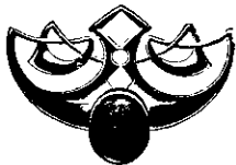
H2282.—9 ct. Gold-mounted Greenstone Brooch, 27/8.