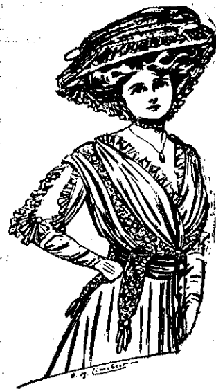
A SMART TOILETTE.

In bathing costumes there is little new to notify. The favourite materials are serge (the varieties known here as "anacoste" and "escot" being the favourite ones) and alpaca. Black, navy blue, red and white, are the usual colours, the first and last being considered the best to resist sea water. White, unless the material is excessively thick and, consequently heavy, becomes semi-transparent when wet, and therefore requires to be lined, thus greatly complicating the "facon." Sky blue is a colour that is often employed for the taffetas costumes. The present fashion in dress shows itself in the ceinture-scharpe, which, in a modified form, is often seen on bathing costumes, and also in the shaped skirt fitting smoothly over the hips, and on which the trimmings are so arranged as to simulate an opening at the side. Broad, of course, is still used as a trimming, but soutache is newer, and very effective. Sometimes the two are combined, or else the soutache, of a contrasting colour, is used on the cross-way bands of the material to form a trimming. The design