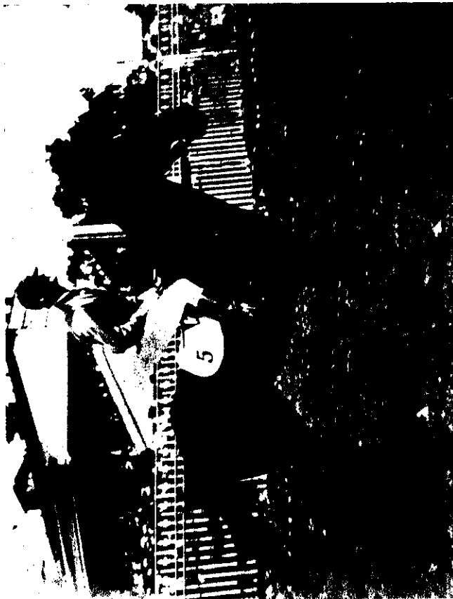
ROYAL SOULT, WINNER OF THE WYNARD AND FARSELL HANDICAPS.