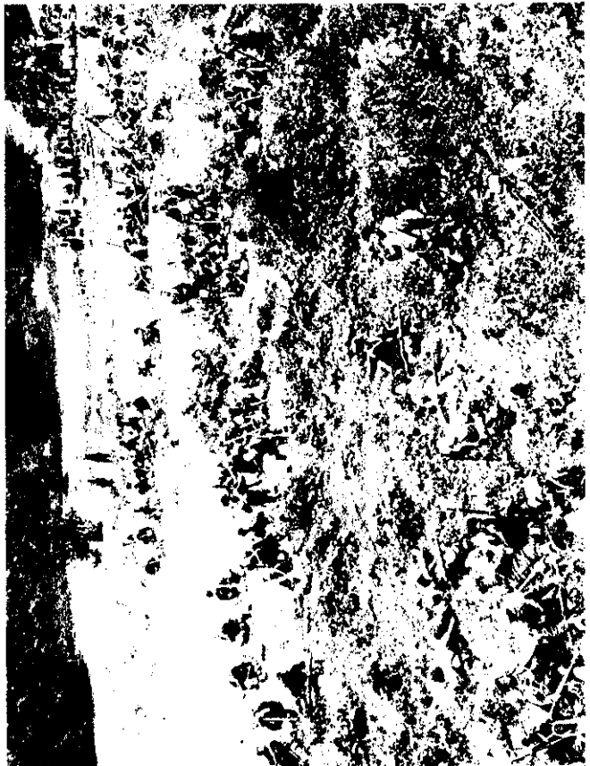
A BAND OF INSURGENT SOLDIERS IN THE RISING OF 1902.