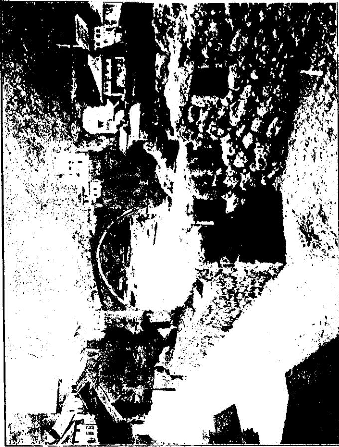
MONASTER, CAPITAL OF HERZEGOVINA.