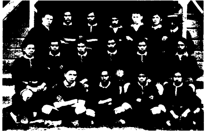
THE SENIOR TEAM.

Towards the end of last week, however, she unexpectedly floated off, and was towed to Whangarei Railway Wharf, where the photo here shown was taken. She has been towed to Auckland for examination, but it is generally feared that her sea-going days are over, as she must be heavily strained.