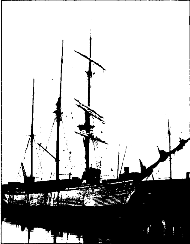
THE BARQUE POLLY, WHICH WENT ASHORE IN THE WHANGAREI RIVER, AND WAS REPORTED TO BE BREAKING UP.

Towards the end of last week, however, she unexpectedly floated off, and was towed to Whangarei Railway Wharf, where the photo here shown was taken. She has been towed to Auckland for examination, but it is generally feared that her sea-going days are over, as she must be heavily strained.