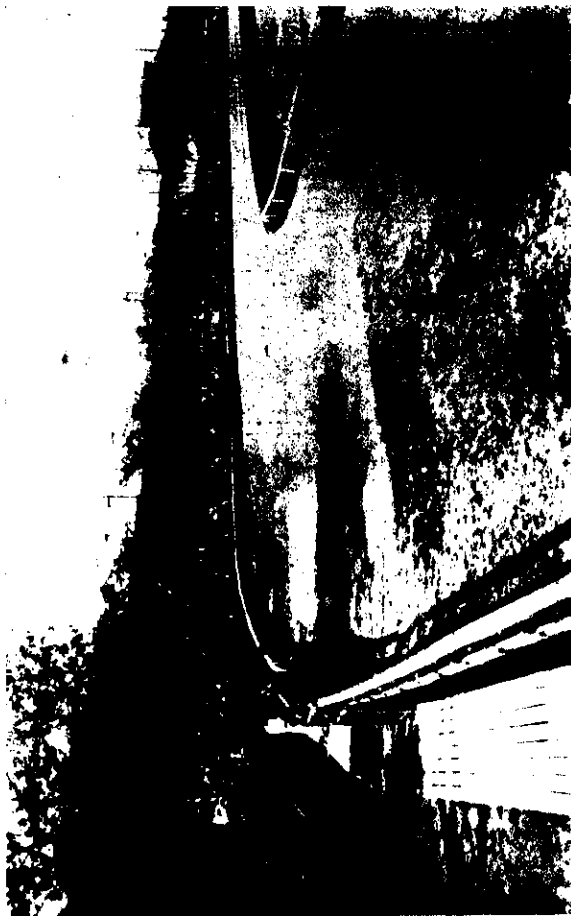
THE WESTERNISING OF CHINA ON THE SHANGHAI RACECOURSE. THE FIRST PICTURE SHOWS THE PORTION OF THE COURSE TO WHICH THE NATIVES ARE RESTRICTED, AND THE OTHER IS A VIEW OF THE LAWN.

Nothing is modernising China so much as the railways, which are run with Chinese officials—drivers, guards, etc.—but the traffic managers are Europeans—chiefly Australians. This line is admirably conducted, is most comfortable, and is fitted up with everything to be found on of the best lines in the West.