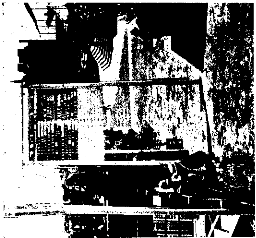
SCRATCHING BOARD AT SHANGHAI RACECOURSE.

This is the Botten Row of Shanghai. Here one will see the most cosmopolitan crowd in the world, and one of the sights of this wonderful city is to watch the costly equipages of the wealthy passing along, each one determined to outdo the other in the luxuriousness of his turnout. A tramway service—one of the finest in the world has just been installed along this thoroughfare.