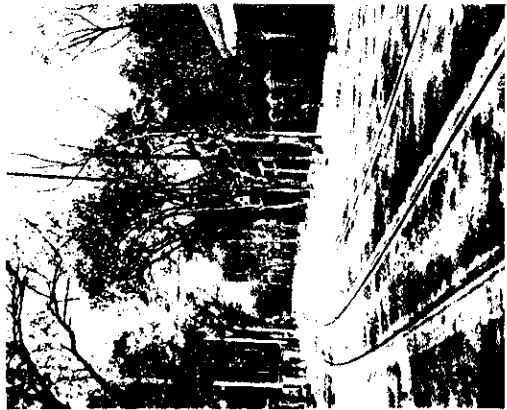
RUBBLING WELL ROAD.

This is the Botten Row of Shanghai. Here one will see the most cosmopolitan crowd in the world, and one of the sights of this wonderful city is to watch the costly equipages of the wealthy passing along, each one determined to outdo the other in the luxuriousness of his turnout. A tramway service—one of the finest in the world has just been installed along this thoroughfare.