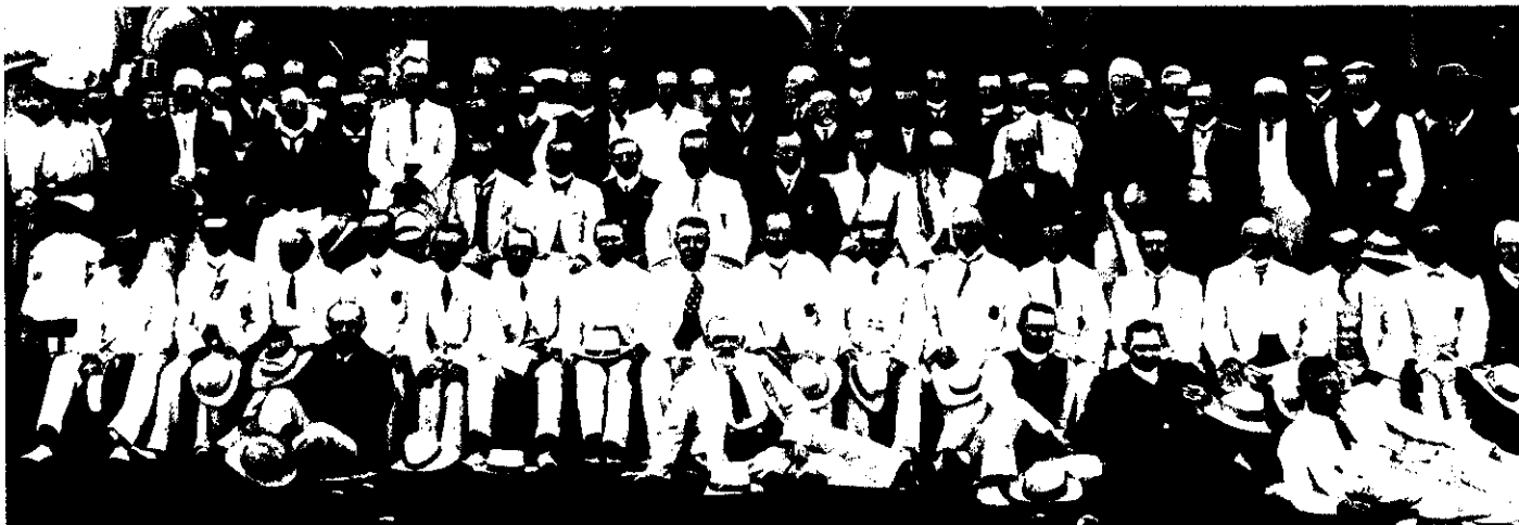
THE GATHERING AT DEVONPORT GREEN, WHERE THE "ALL WHITES," AS THE TRAVELLERS WERE CALLED, DEFEATED THE AUCKLAND MEN BY 144 POINTS TO 100.