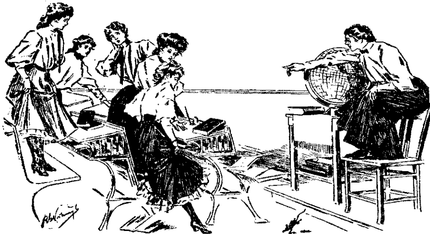
A TRUE LEADER.

He: "You admire the view? Then marry me and it is yours." She: "Thank! I prefer my landscape without figures."