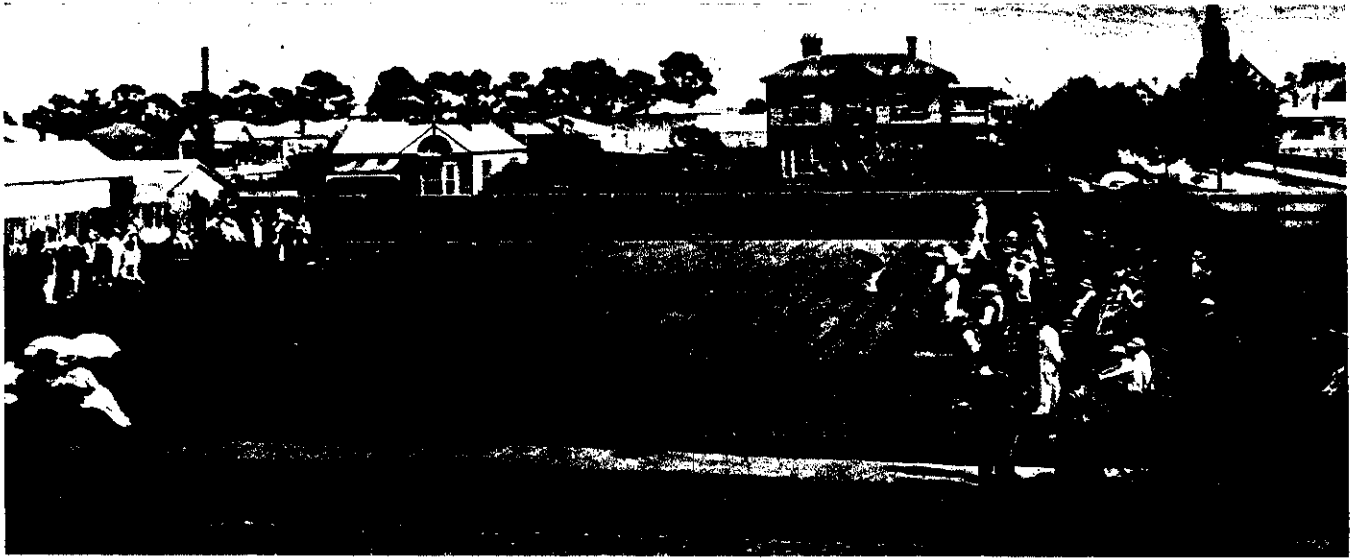
FIRST DAY'S PLAY OF THE BOWLING TOURNAMENT.