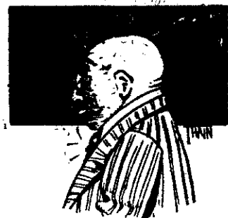
"EVEN THE HAIRS OF THY HEAD ARE NUMBERED."