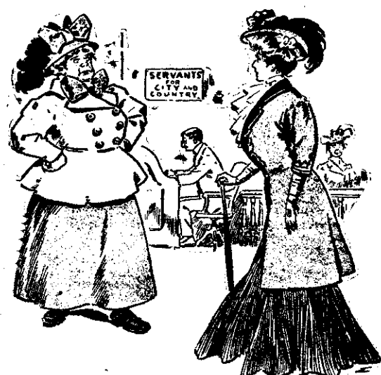
THE RETORT SARCASTIC.

The Bachelor (who never could say the right thing at the right time): "Ah—congratulations, and many happy returns."