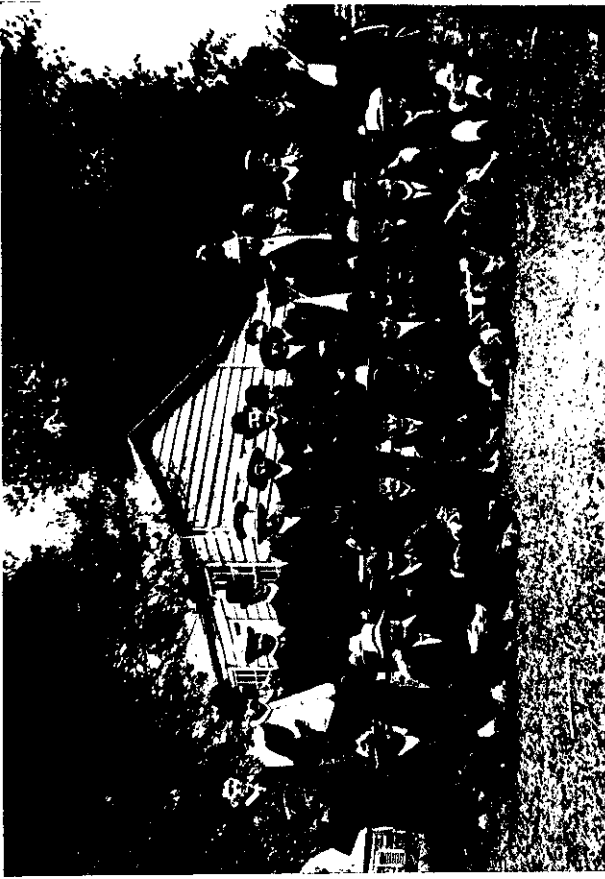
OFFICIALS AND GUESTS WHO WERE PRESENT AT THE OPENING.