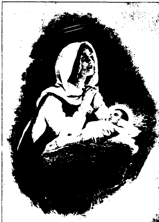
THE QUEEN'S CARD.