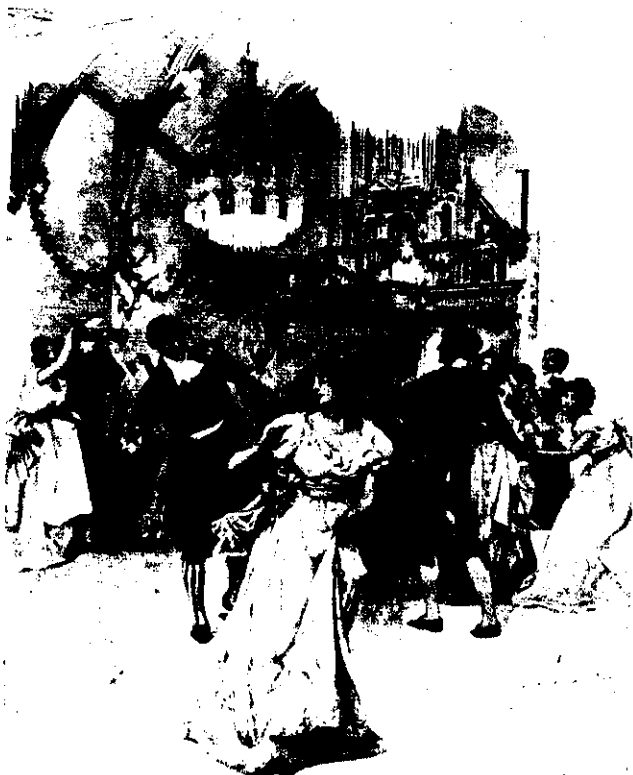
THE KING'S CARD.

The successful New Zealand vocalist in M. J. C. Williamson's "Blue Moon" Company, which opens in Auckland on Boxing Night.