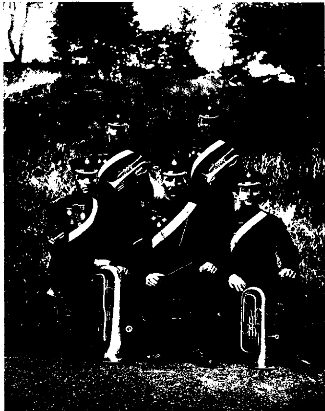
QUARTETTE PARTY, WHO CARRIED OFF THE FIRST PRIZE.