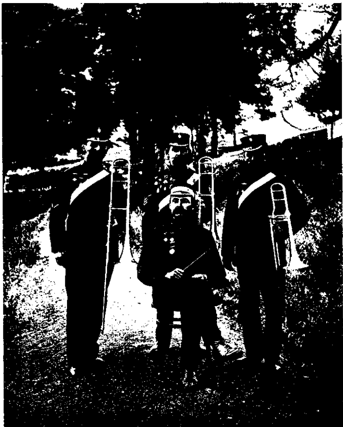
TROMBONE TRIO, WINNERS OF THE FIRST PRIZE.