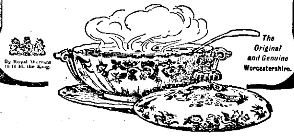
The Original and Genuine Worcestershire.

This celebrated sauce is also an excellent flavouring for SOUPS, STEWS, HASHES, &c.