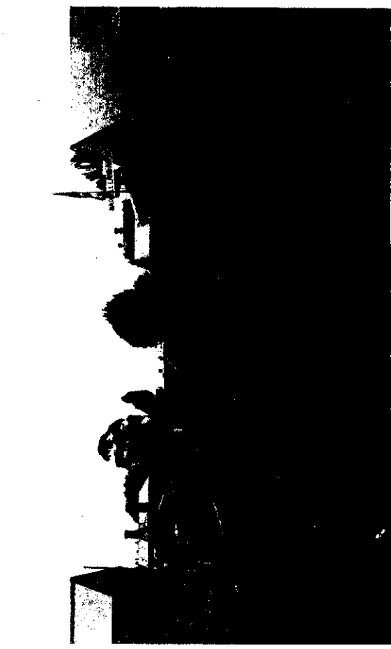
CRITERION HOTEL, CORNER OF VICTORIA AND DUKE STREETS.