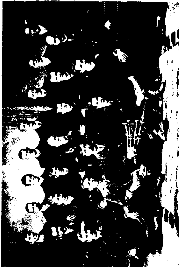
NAPIER RAILWAY LIBRARY SOCIAL COMMITTEE, 1907.