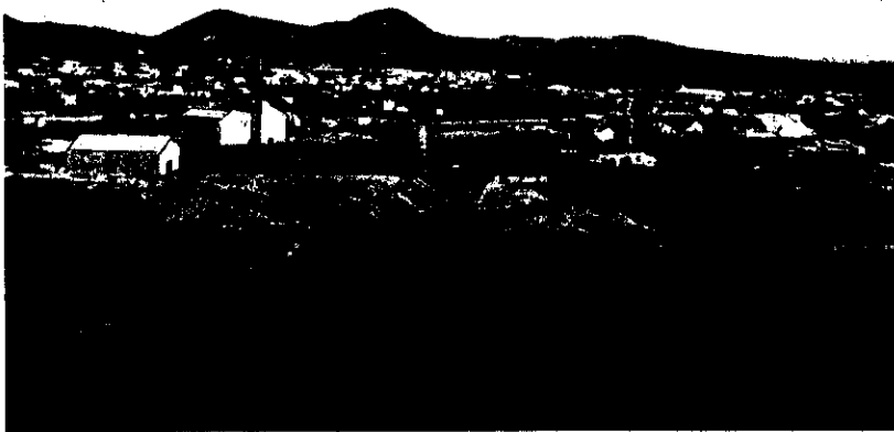
EXTENSION WORKS, WAIHI GRAND JUNCTION BATTERY.

town naturally became very much scattered, and the result has been the construction of miles of roads and streets that should never have existed. The borough, therefore, has had an immense tax placed upon its financial resources, and the reduction of any part of its gold-duty would certainly prove disastrous just now when so much still requires to be done. The council, however, has unquestionably done remarkably well, and during its very short existence has brought in a water supply for domestic and fire purposes at a cost of about £21,000, erected municipal gas works at a cost of about £2000, so that it will be seen our city fathers believe in keeping the birthright of the people intact as far as possible. Moreover, the council has also grassed, and laid out with trees, etc., a fine recreation ground, which embraces a bowling green, of which visiting bowlers speak in the highest praise; in fact, it is regarded as one of the best greens in the province, thus removing for ever the idea that "grass will not grow in Waihi." The council has now under consideration the erection of swimming baths, and everything possible is being