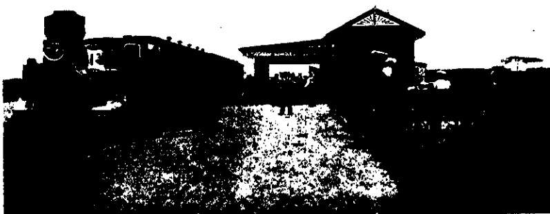
WAIHI RAILWAY STATION.

Commercially, the town will hold its own with any town of similar size in the Dominion, and when the distance from the main producing centres is considered, together with heavy freights, etc., it is marvellous that goods can be purchased at such cheap rates as prevail; indeed, goods are sold, in some instances, at a lower rate than those which obtains at Paeroa, the neighbouring port for the Upper Thames district. The main street, which comprises the principal places of business, has now been designated Seddon-street, in memory of the late Premier, and possesses some handsome shops, in the most of which wares and goods are invitingly and temptingly arrayed. The fronts now all comprise plate-glass windows, and, generally speaking, the shops are up to date.