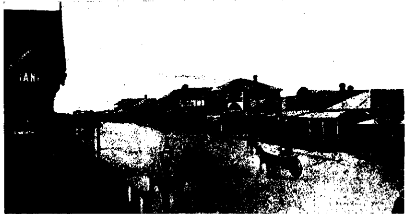
MAIN STREET, WAIHI, LOOKING NORTH.

Municipally the affairs are under the control of the Waihi Borough Council, which was formed several years ago, owing to the persistent agitation that Waihi, although producing the greater portion of the Ohinemuri County's revenue, was not receiving its fair share of roads, paths, etc. The new council, with an herculean task before it, set about immediately in the effort to make the place more habitable, and it has done wonders in this direction. Owing to so many acre residence sites having been granted by the Warden's Court, before the actual importance of Waihi had disclosed itself, the residential part of the