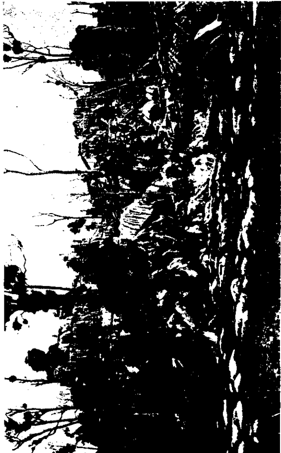
THE LIMESTONE ROCKS FROM THE RAILWAY LINE.