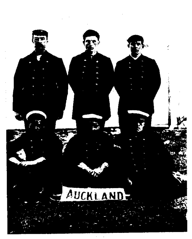
AUCKLAND TEAM, WINNER, THIRD PRIZE CONSOLATION HOSE AND HYDRANT EVENT.