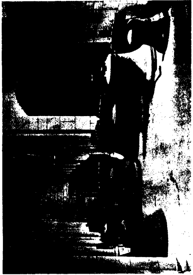
CHIMES OF ST. MATTHEW'S CHURCH. These are the bells which hung in St. Barnabas' (chapel, Bishopscourt, Parnell), for a number of years, and are now being placed in the tower of St. Matthew's having been lent to the parish by the General Trust Board.