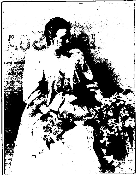
THE QUEEN OF THE HELLENES.