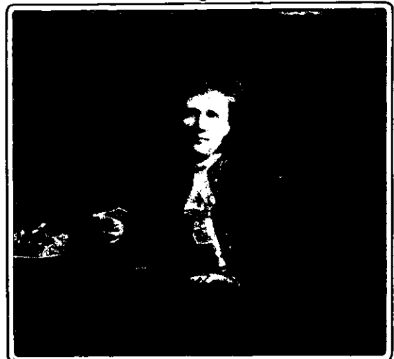
THE GRAND DUCHESS CONSTANTINE OF RUSSIA.

POSITION UNRIVALLED IN LONDON (ENGLAND). THE LANGHAM HOTEL PORTLAND PLACE AND REGENT STREET, LONDON, N.W.