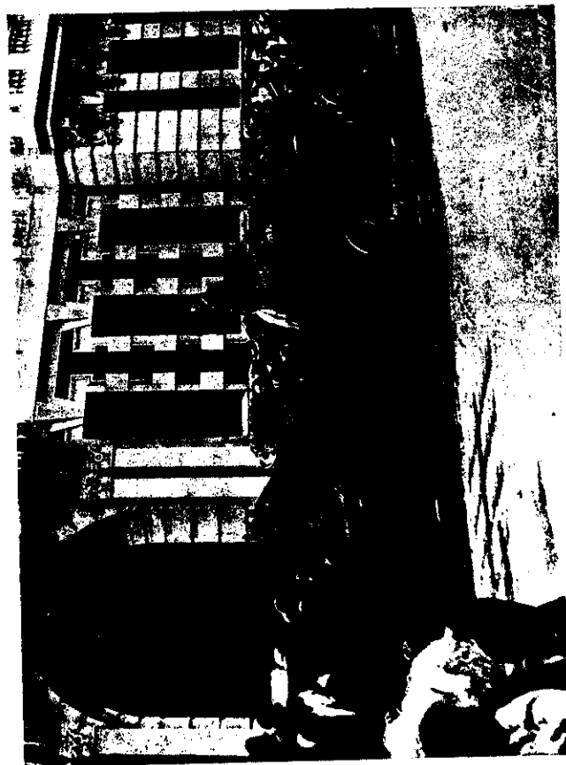
ARRIVAL OF HIS EXCELLENCY THE GOVERNOR.