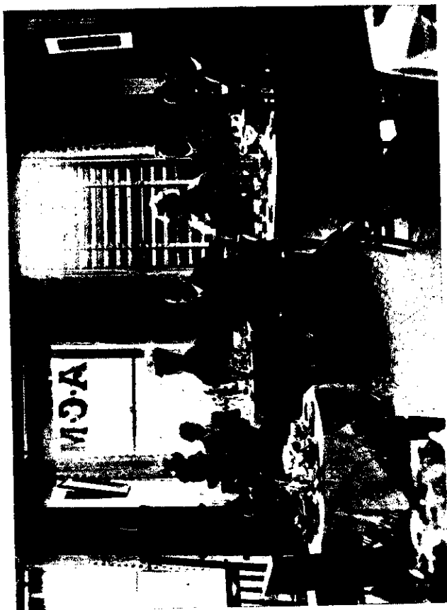
SIR J. G. WARD AND PARTY AT THE A.C.M. ROOMS AFTER THE CEREMONY.