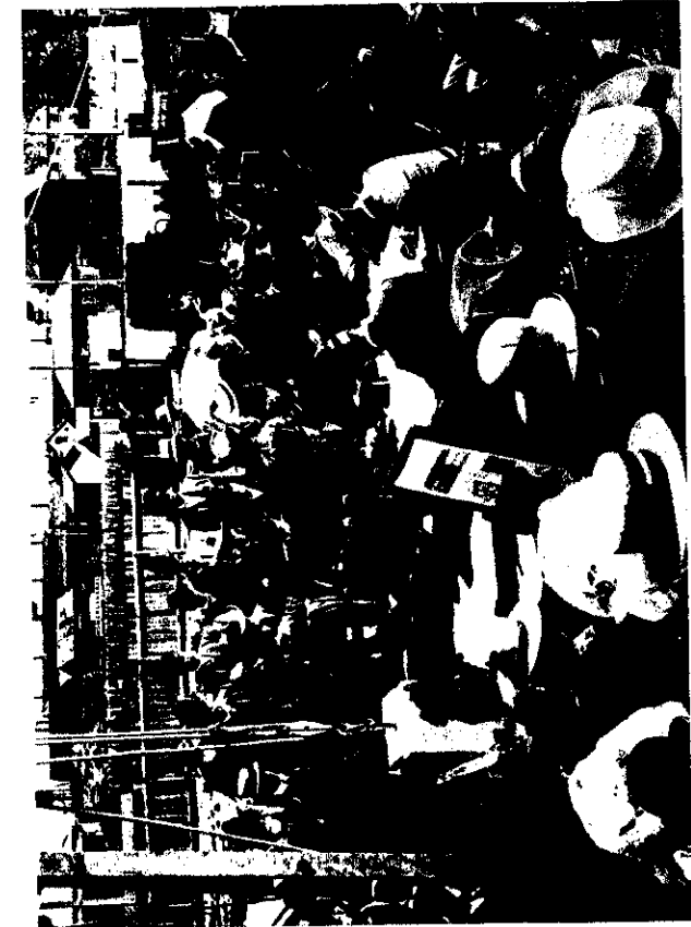
THE LAYING OF THE FOUNDATION STONE OF THE SEDDON MEMORIAL TECHNICAL COLLEGE AT CHRISTCHURCH BY THE HON. GEORGE FOWLDS (MINISTER FOR EDUCATION).