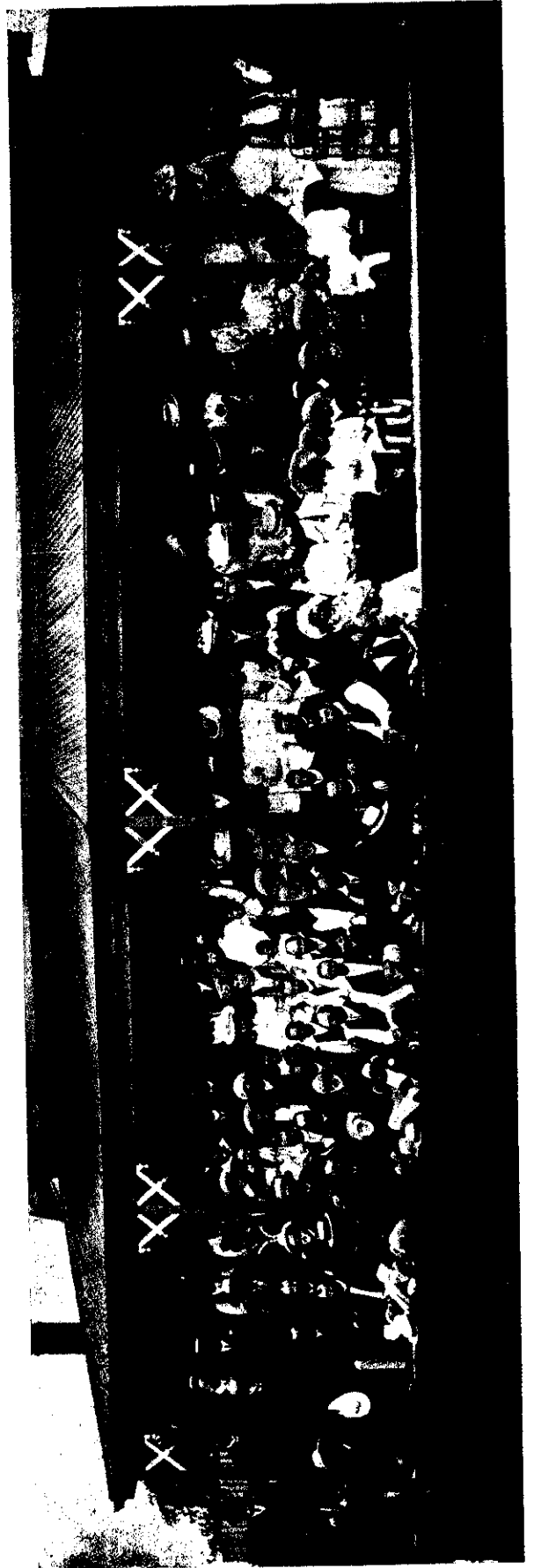
BOWLERS AND GUESTS PRESENT ON THE OPENING DAY OF THE GREEN MEADOWS (NAPIER) CLUB.