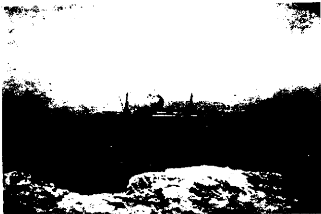
Heavily laden coastal steamer thrashing through rough confused sea.