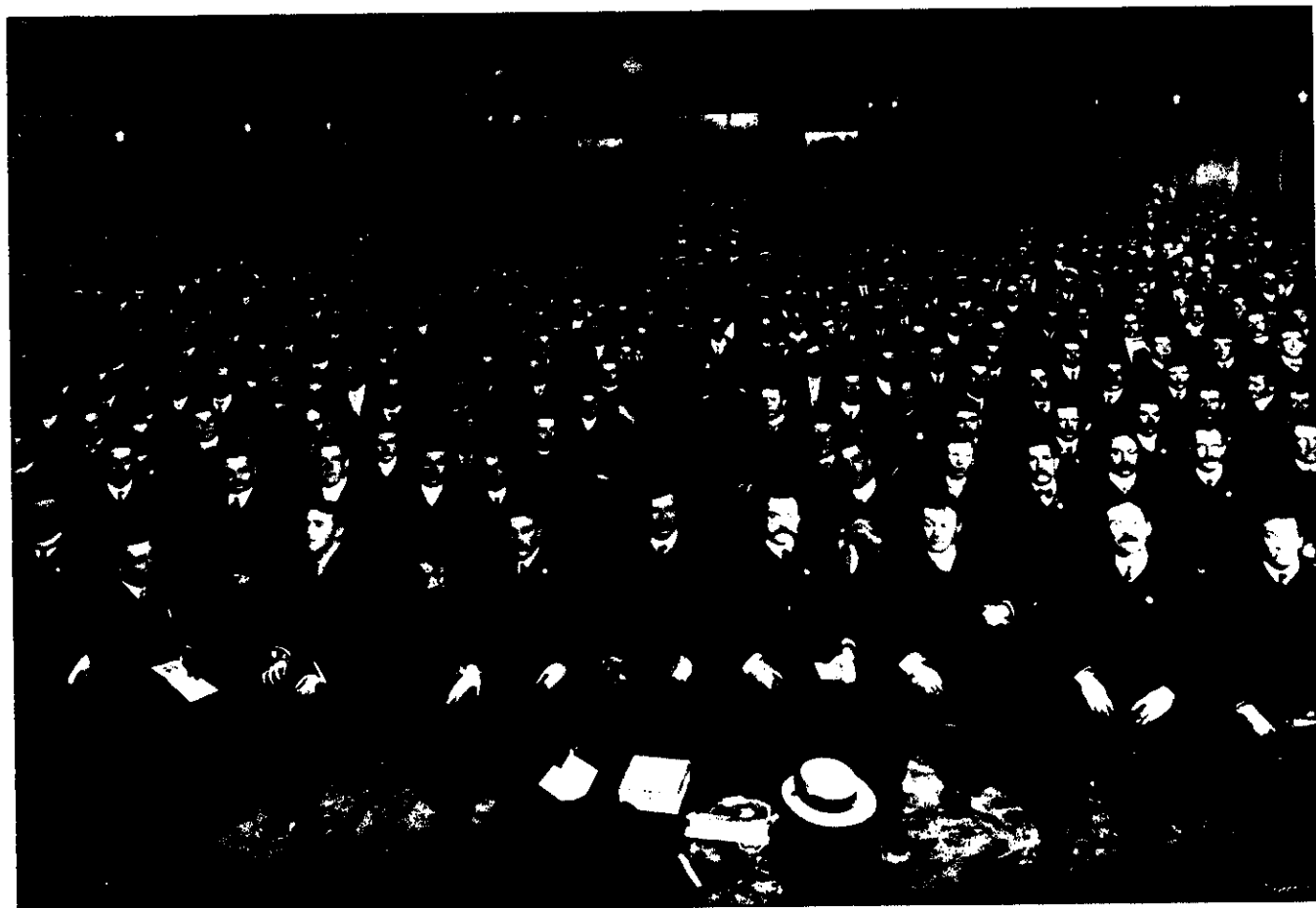
FLASHLIGHT PICTURE OF THE VAST AUDIENCE AT THE SMOKE CONCERT TENDERED TO THE AUCKLAND CITY FOOTBALL TEAM IN SYDNEY TOWN HALL.