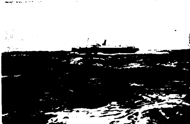
Lightly laden steamer rolling violently.