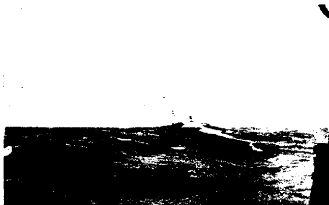
In a very high sea: Ahaura signalling to Rosamund to anchor.