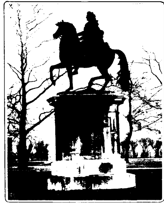
KING WILLIAM III. ST. JAMES' SQUARE.