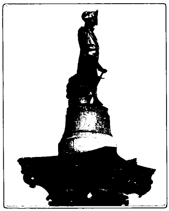
LORD NELSON IN TRAFALGAR SQUARE.