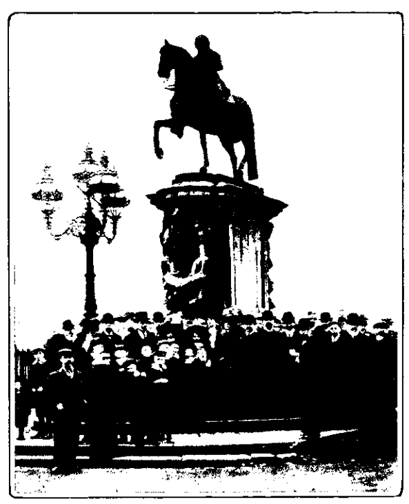
CHARLES 1.—TRAFALGAR SQUARE.