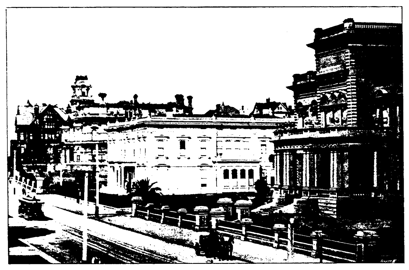
THREE PALATIAL RESIDENCES DYNAMITED TO PREVENT THE SPREAD OF FIRE. THE HOMES OF MIJLIONAIRES CROCKER, HUNTINGTON, AND FLOOD.