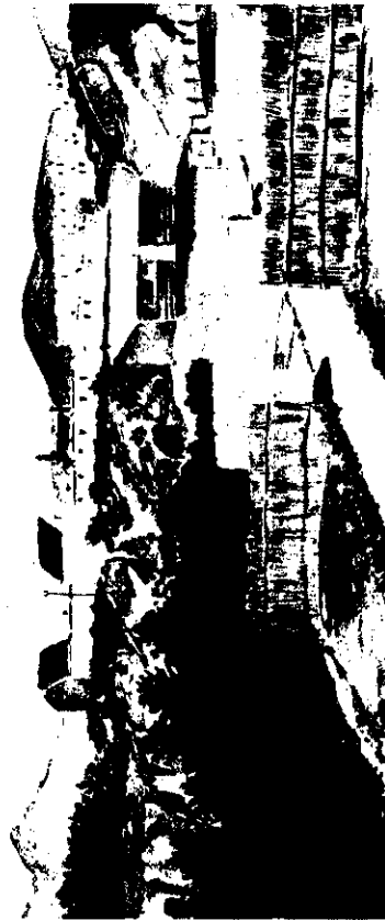
SKETCH IN OIL OF THE WAIOTAPU PRISON CAMP, BY AN INMATE.

The points for this remarkable picture were secured by the prisoner concerned by scapping buildings, etc., and the brush was manufactured from another prisoner's hair. It is a striking example of the difficulties prisoners will sometimes encounter in relieving the monotony of captivity by some hobby.