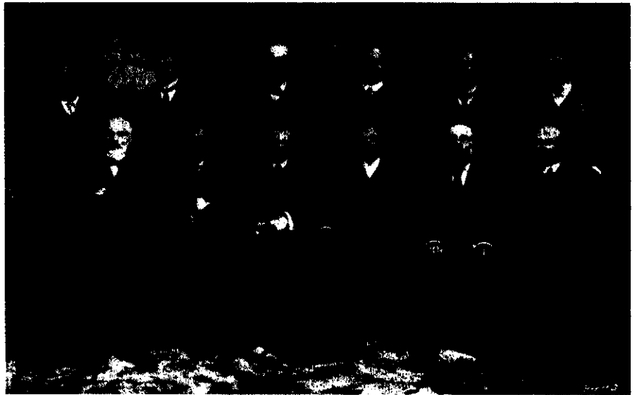
MEMBERS OF THE EXECUTIVE COMMITTEE OF THE NORTH ISLAND BAND CONTEST, TO BE HELD AT HAWERA AT THE END OF THE MONTH.