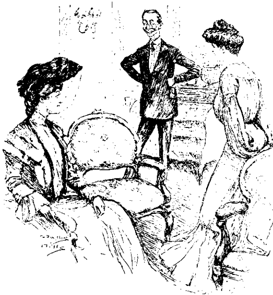
AND NO WONDER.

Jones: "So you have succeeded in tracing back my ancestors? What is your fee?" Genealogist: "One thousand dollars—for keeping still about them."