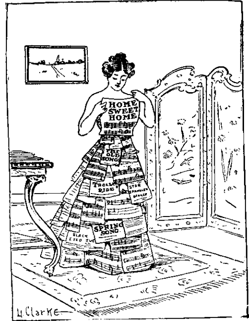
PUTTING ON AIRS.

Budding M.P.: "That's the worst of having a reputation for being a humorist. No sooner did I stand up and open my mouth to make my speech than they all yelled with laughter." —From "Punch."