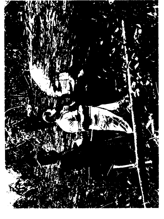
2. CROSS-CUTING A BIG TREE TO FACILITATE ITS REMOVAL FROM THE BUSH.