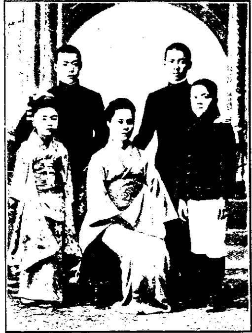
ADMIRAL TOGO'S WIFE AND FAMILY.

"So, at a very early age, I became familiar with actors' parts—also with