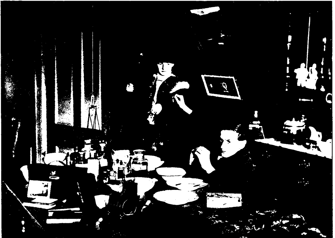
THE AMATEUR PHOTOGRAPHER AT HOME.

The auxiliary schooner Vaite, fitted with a 55 h.p. Hercules oil engine, leaving Auckland Harbour for Rarotonga.