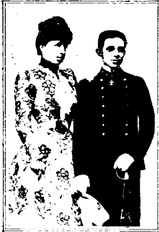
THE KING OF SPAIN AND HIS MOTHER.