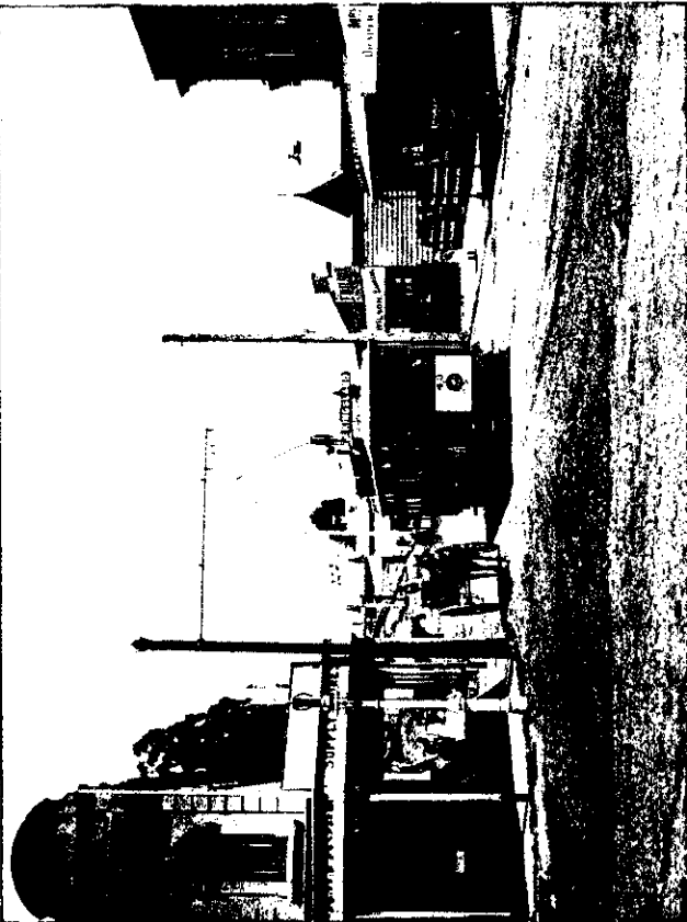
THE PRESENT TERMINUS AT KINGSLAND.