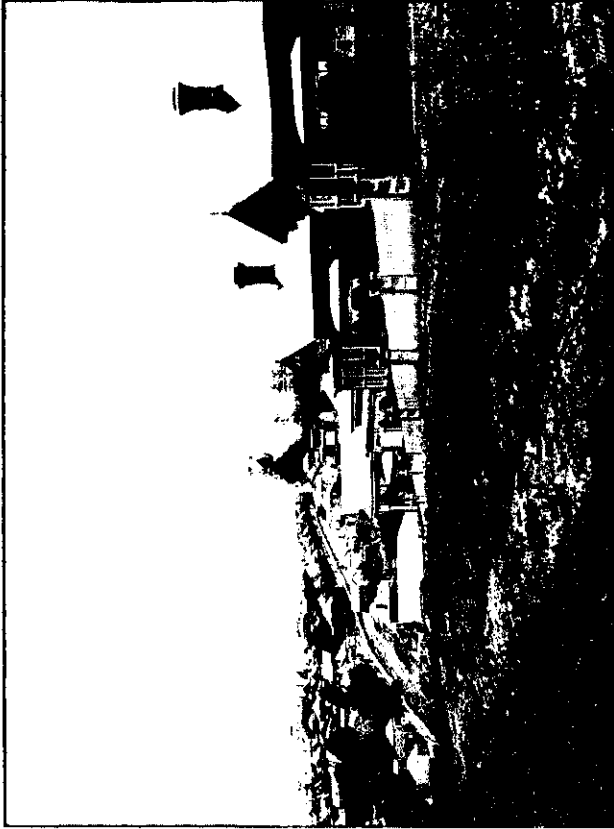
A TYPICAL NEW SIDE STREET, JUST OFF THE TRAM LINE.