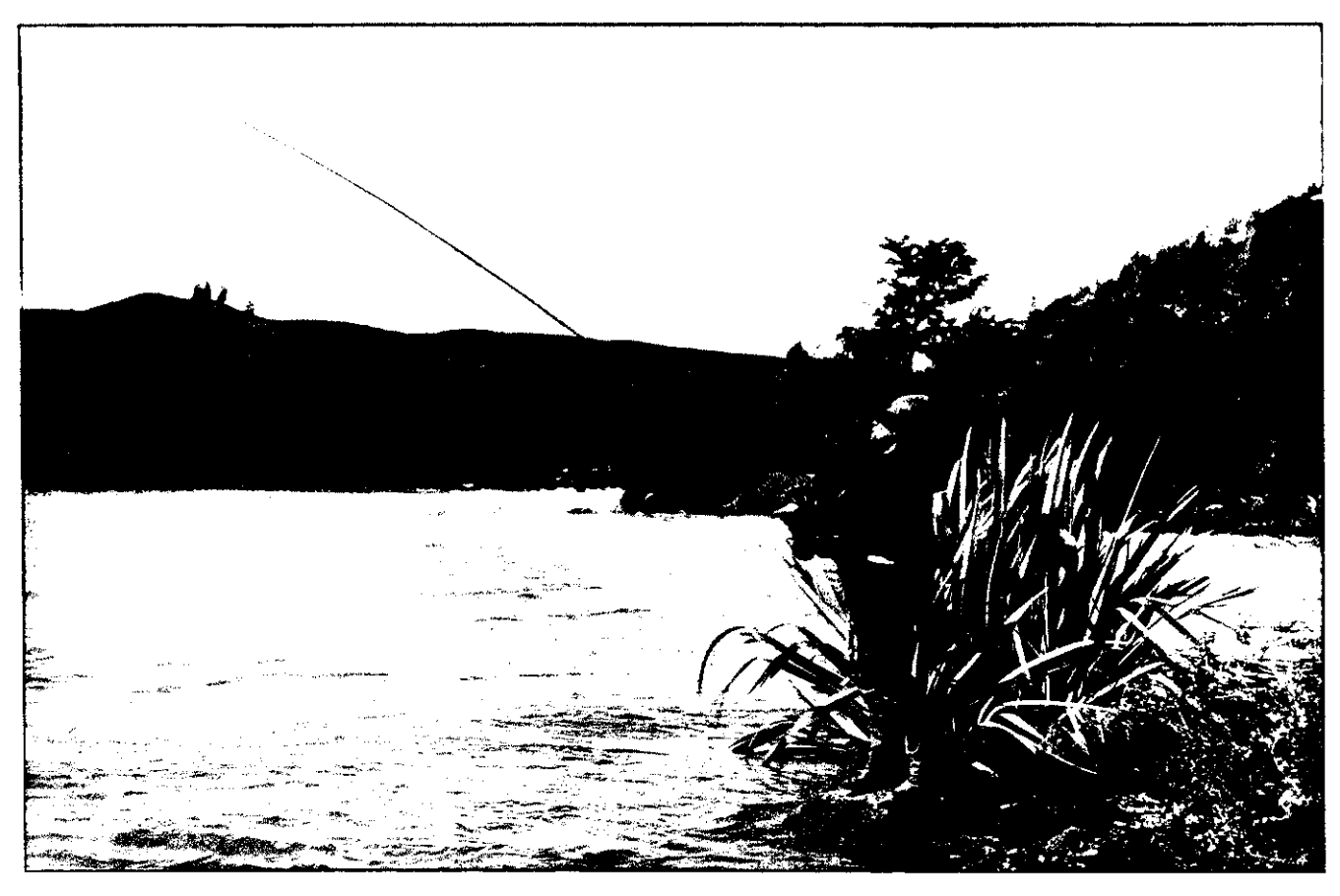
A FAVOURITE FISHING SPOT, WAIKATO RIVER, NEAR TAUPO.