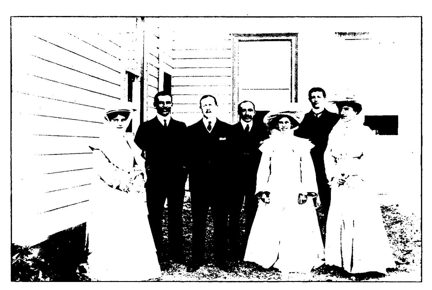
HIS EXCELLENCY THE GOVERNOR, LADY PLUNKET AND THE GOVERNMENT HOUSE PARTY AT WAIWERA HOUSE