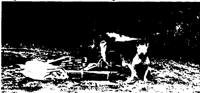
THE CAMP PACKED UP.

An aluminium cooking and eating outfit for four persons, all of which goes into the canvas case shown here, and weighs 10lb.