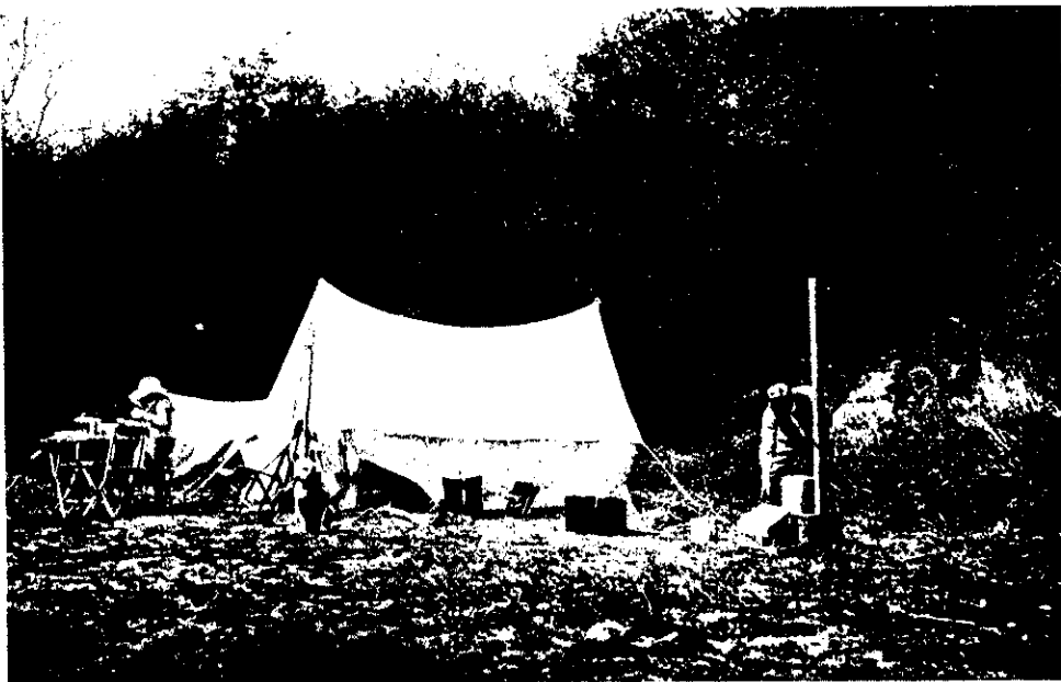
EVENING IN CAMP—GETTING READY FOR SUPPER.