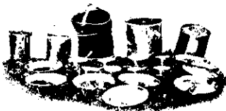
POTS AND PANS.

An aluminium cooking and eating outfit for four persons, all of which goes into the canvas case shown here, and weighs 10lb.