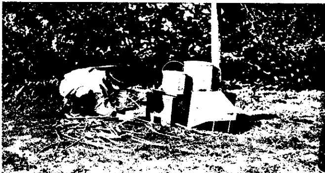
THE FOLDING-STOVE AND BAKER AT WORK.