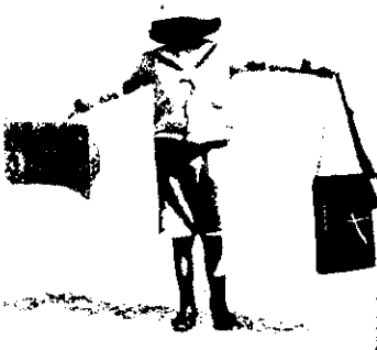
THE BAKER AND ITS CANVAS CASE

This is what it means: carrying on your car a light complete camping outfit; travelling as little or as long as you like during the day; stopping at the most charming spot you can find; pitching your tent and cooking your supper; spending a quiet evening strolling about, or reading and chatting, going to some hill-top "to see the world turn," or enjoying that most exquisite mental and spiritual intoxication of simply contemplating the stars for an hour or two; sleeping the best sleep to be had in the world; and next morning packing up and away 50 or 100 miles, to stop again in wholly different surroundings. The