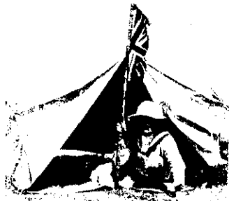
"LITTLE BEAVER" AT HOME IN CAMP.

combination of car and camp gives the greatest freedom possible to the ordinary city-dweller, and confers pleasures in his own land which he has before sought only at the end of expensive and tiresome journeys.