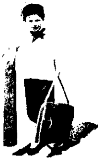
A VERY PORTABLE STOVE.

There is, however, one added pleasure and source of health a car may give which has not yet, so far as I know, been touched upon. This is not for the wealthy car-owner, who seeks luxury and must have his formal and many-course dinner every night. The possessor