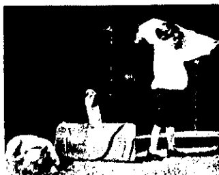
A HANDY TENT.

The motor-car is now recognised by everybody as a revolutionary agent. Its effects are only just beginning to make themselves felt, but they will obviously be many and far-reaching. A car adds years to many a man's life by giving him several more working hours in the day. It confers a much wider range of personal activity and movement. It is bringing dwellers to houses hitherto practically inaccessible, and is, therefore, raising the price of much land in