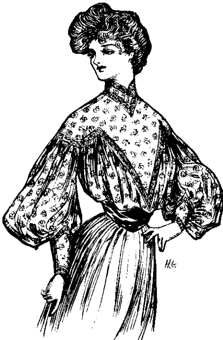
A SMART VIYELLA BLOUSE.