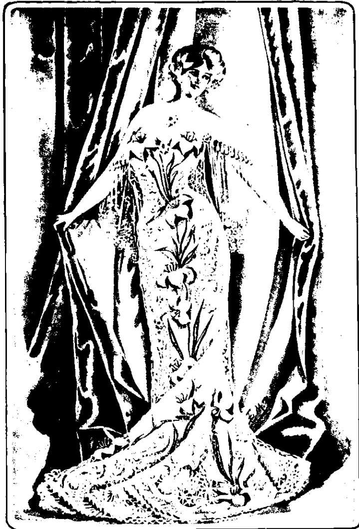
DES TOILETTE PARISIENNES.

CLEARSKIN SOAP. —Absolutely the best Skin Soap for tender or delicate skins and for the nursery.—By post, 1/6 box (3 tablets).—From W. BENTLEY & CO., Chemists, Whangarei.