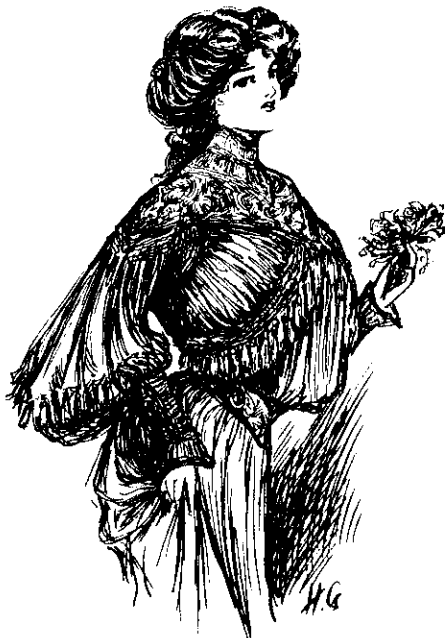
A BECOMING BLOUSE.

This blouse is of crepe de chine. The yoke, waistband, and sleeve piece are of chine silk to tone with the rest of the material. The guggings and sleeves are finished with a fringe.